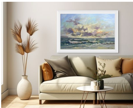
Evening Breakers, Milford on Sea - £ 800.00 (framed size: 62 x 87 cm)

On a visit to Milford on Sea, I walked down to the beach after a very wet and stormy day. The surf was still very rough with some breakers coming over the sea wall. Not an evening to put up my easel, so I took some photos and video footage instead before heading home.